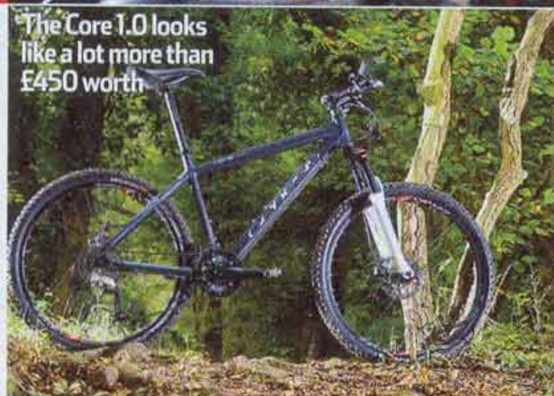
The Core 1.0 looks like a lot more than £450 worth