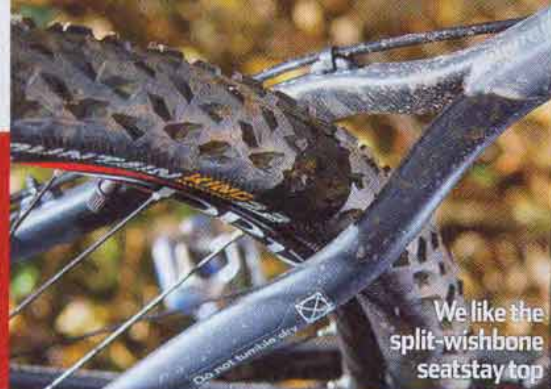
We like the split-wishbone seatstay top